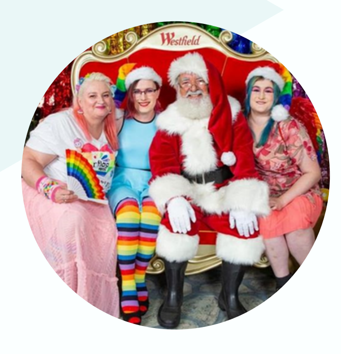
LIVING PROUD AT CHRISTMAS in partnership with Westfield and The Scentre Group

Living Proud was privileged to benefit from a number of high-profile fundraising events during the year. We extend our deep gratitude to all our fundraising partners and thank you for your contributions.